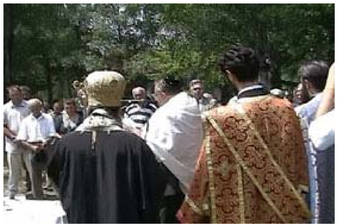
Commemoration at Susnjar of the 5,500 victims of Ustasha.