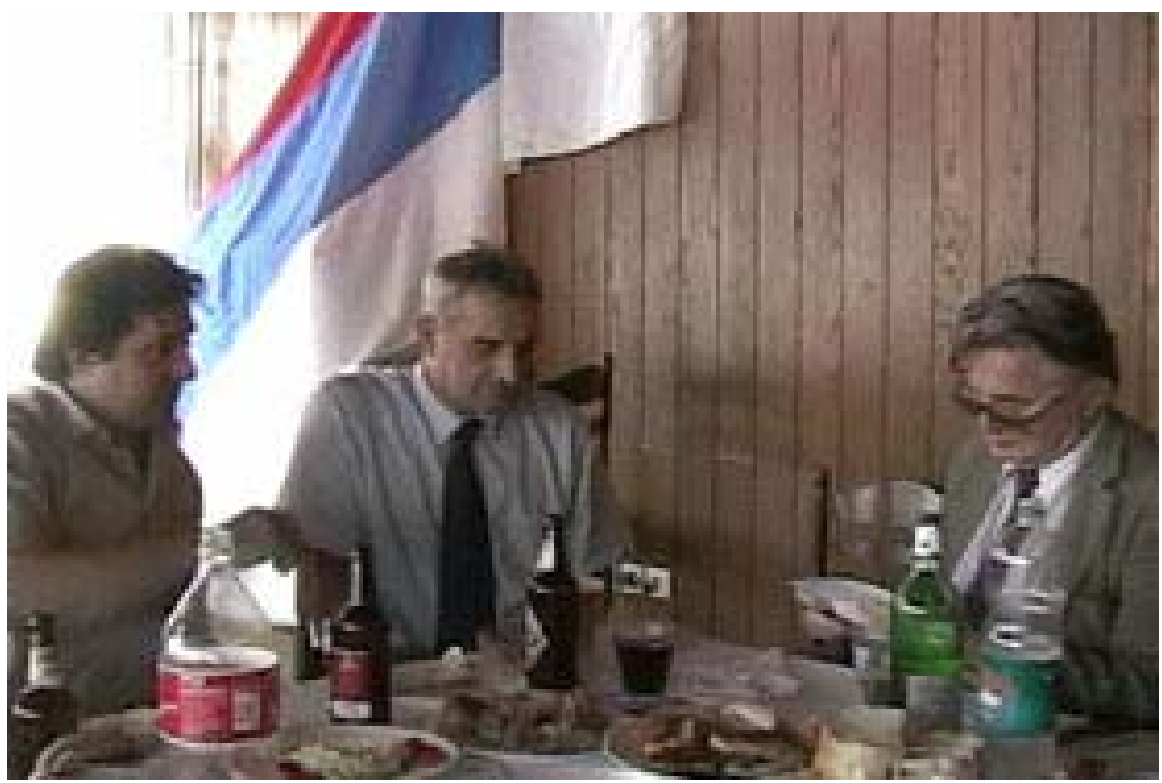
Lunch at Serbian Sanski Most after the Susnjar commemoration.