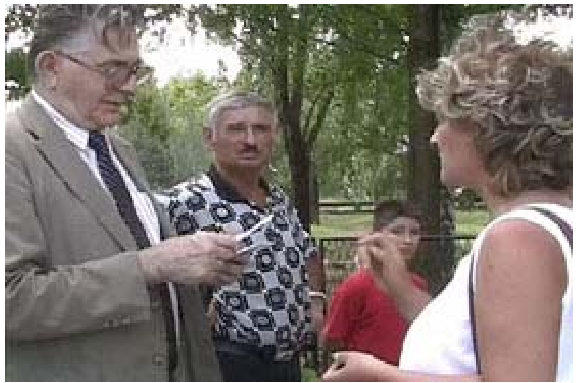
Family of Susnjar victims must survive in Muslim-controlled Sanski Most.