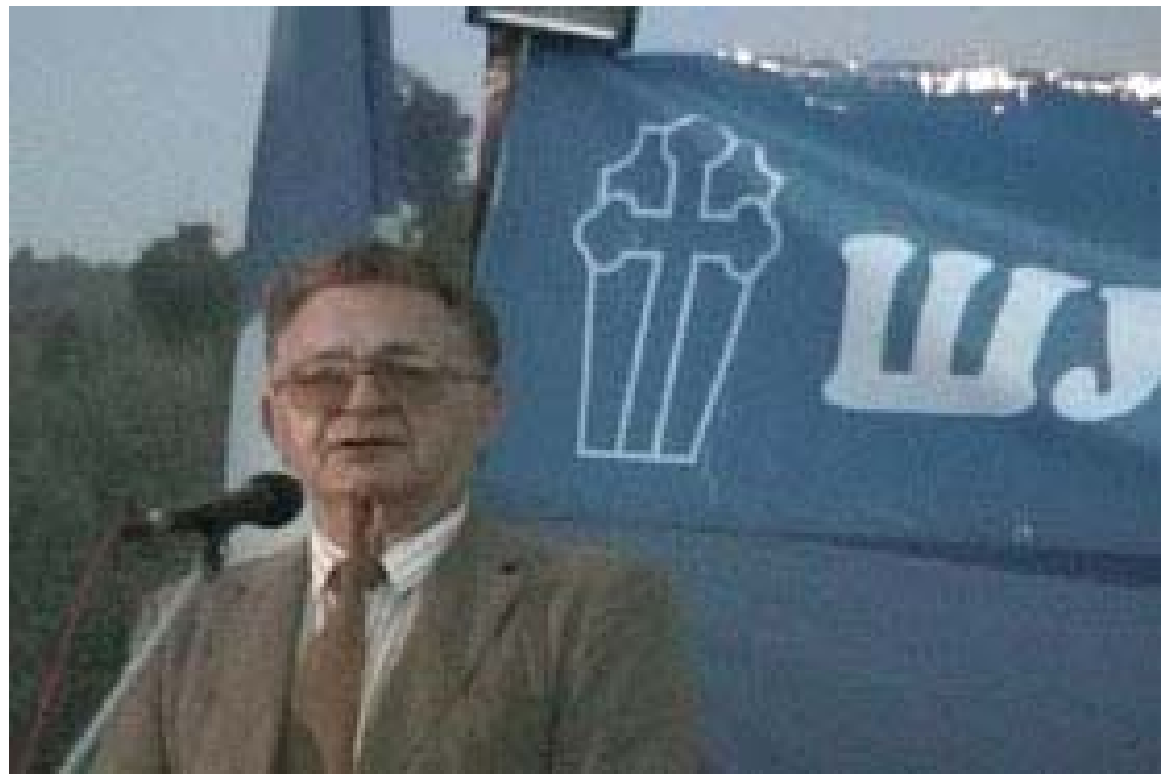
An evening poetry reading at Serbian Sanski Most. (2003)